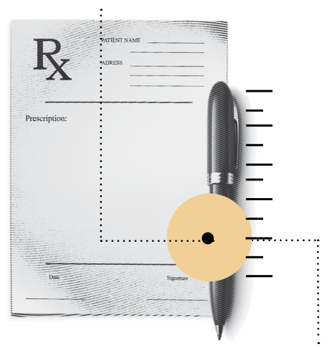
struggle with opioid use disorder.

patients receiving long-term opioid therapy in primary care settings