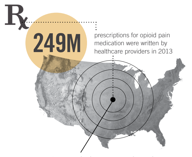
enough prescriptions were written for every American adult to have a bottle of pills

Many Americans suffer from chronic pain. These patients deserve safe and effective pain management. Prescription opioids can help manage some types of pain in the short term. However, we don't have enough information about the benefits of opioids long term, and we know that there are serious risks of opioid use disorder and overdose—particularly with high dosages and long-term use.